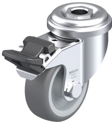
Corresponding standard locking LRA-TPA 50G-FI