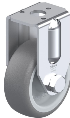
Corresponding fixed castor BRA-TPA 50G