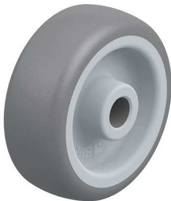
Wheel used TPA 50/8G